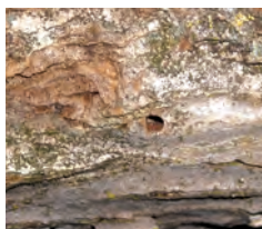
"D" shaped exit holes