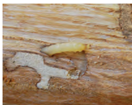
feeding galleries and larvae

Despite the challenges presented by the TLCB you can take steps to protect your tree. Current insecticide technology, Xytect, can protect your tree from TLCB and other insects, including the birch leafminer. With one soil treatment your tree will have year long protection. Success is ultimately determined by both tree condition and treating the tree before it is challenged by TLCB.