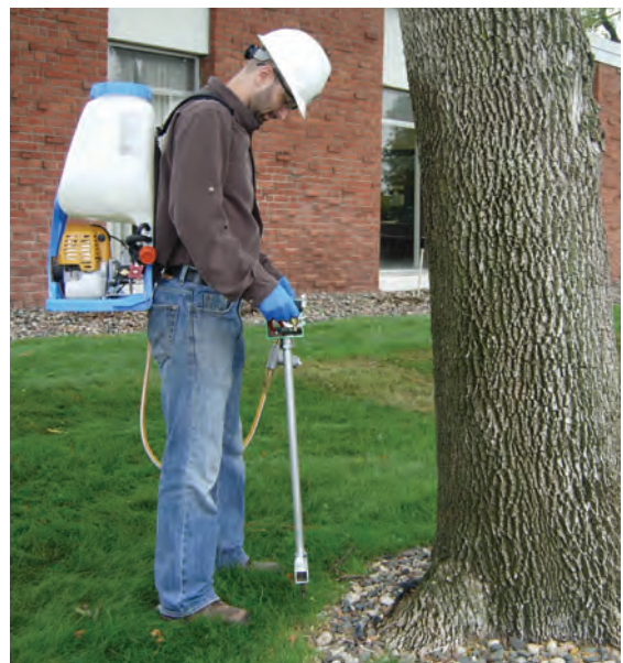
Soil injection of Xytect provides annual protect from TLCB