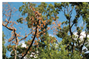
TLCB symptoms in canopy