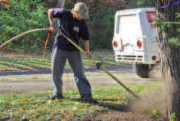
The Air-Spade is an air powered tool that allows an arborist to remove, excavate, or aerate soil without damage to sensitive roots.