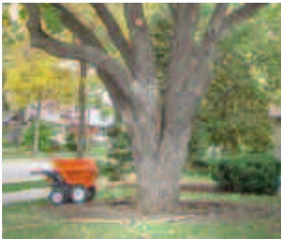
Although this tree is mature it has no visible root flare, a sign that the tree may be too deep. This, combined with a thin appearance to the canopy, prompted a root collar inspection.