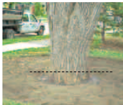
A root collar inspection revealed this tree to be too deep. Nearly a foot of soil was removed around the tree using an AIR-SPADE tool. The dotted line shows the original soil grade.