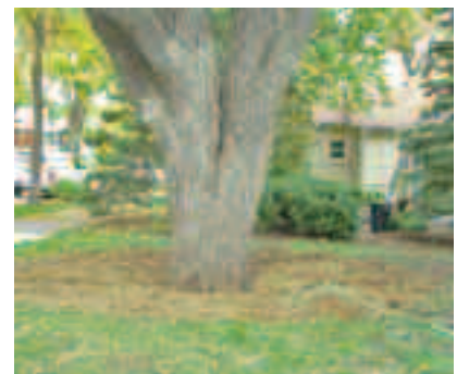
The finished treatment. This oak tree's roots are now closer to the surface where they will have greater access to the air they need. A layer of organic mulch was added to the completed project.