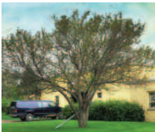
infected apple trees will begin to defoliate in midsummer leaving a thin or weak appearing canopy