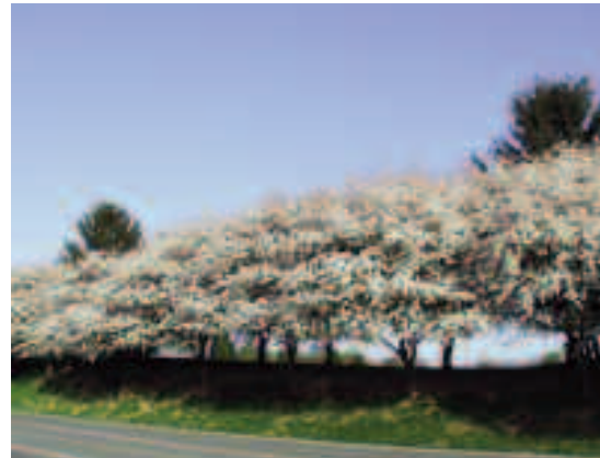
trees that are treated for apple scab will continue to thrive and add value to the landscape