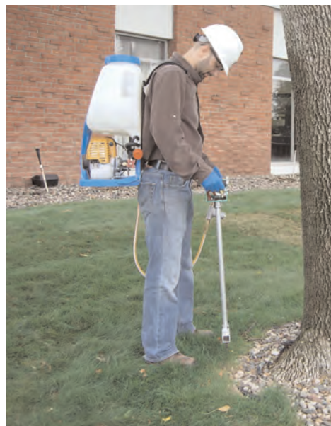
Soil injection of Xytect provides annual protect for your birch tree.