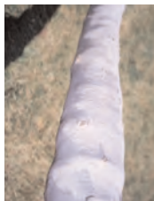
BBB larvae under the bark