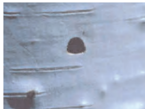
"D" shaped exit holes