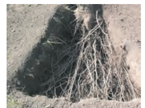
3 years after treatment