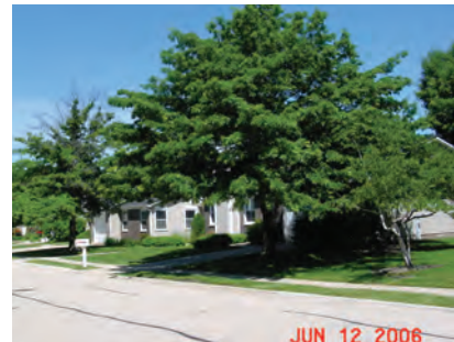
treated with Verdur