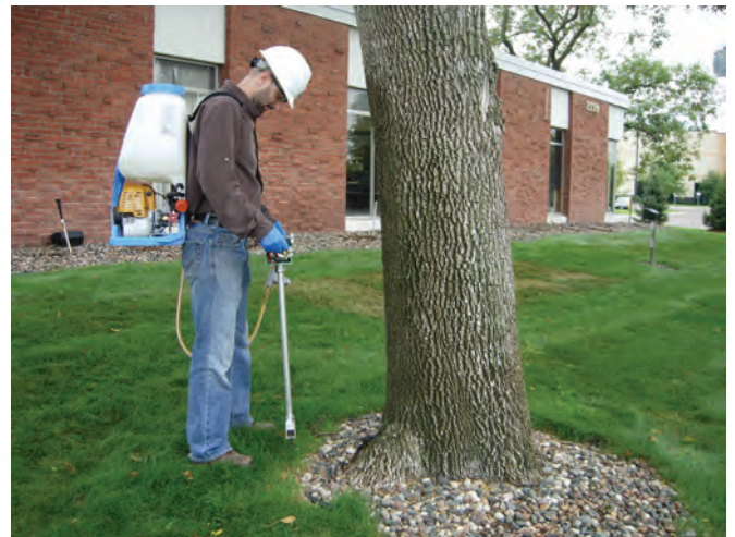
Soil injection of Xytect provides annual protection for your ash tree.