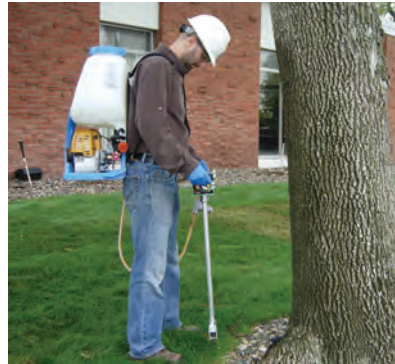
Soil injection of XyTECT provides annual protection for your ash tree.