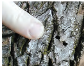
"D" shaped exit holes