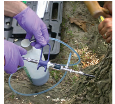
A tree injection of TREE-age can control EAB in an infested tree