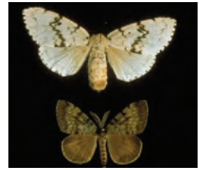
cream colored females are flightless and larger than the brown colored males