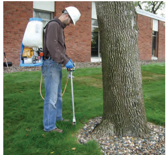
treatment of trees with Lepitect is done via soil injection

Lepitect Infusible and Aracinate should be applied at or just prior to full leaf emergence in the spring.