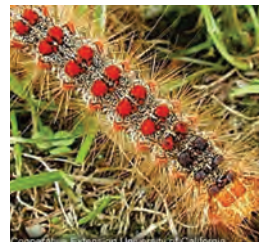
gypsy moth caterpillars have 5 pairs of blue spots and 6 pairs of red spots

Heaviest pest pressure remains in the eastern US.