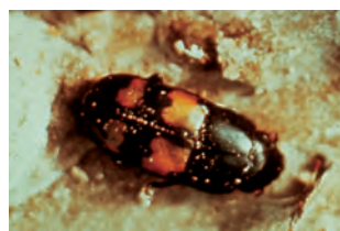
The Nitidulidae beetle is responsible for the majority of overland transmission of oak wilt.

takes place throughout the spring and early summer, while in the south it can occur any time of the year.