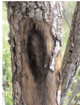
Fungal spore mat develop under the bark of the tree that attracts sap feeding beetles.

Sap feeding beetles (Nitidulidae) are the most common insect vector, but bark beetles (Scolytidae) have also been reported as a vector. They feed on fungal spore mats that form between the bark and the wood of the oak, and carry oak wilt spores to wounds on uninfected trees. In the northern range overland transmission