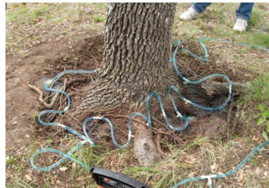
Alamo fungicide oak wilt infusion will last for 2 growing seasons. A second treatment will need to be done at the end of the second growing season.

White Oak Group: Bur and white oaks may be treated preventively or therapeutically.