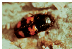
The Nitidulidae beetle is responsible for the majority of overland transmission of oak wilt.

takes place throughout the spring and early summer, while in the south it can occur any time of the year.