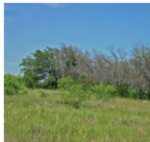
Oak wilt spreads from infected trees to healthy trees through root graft transmission

Sap feeding beetles (Nitidulidae) are the most common insect vector, but bark beetles (Scolytidae) have also been reported as a vector. They feed on fungal spore mats that form between the bark and the wood of the oak, and carry oak wilt spores to wounds on uninfected trees. In the northern range overland transmission