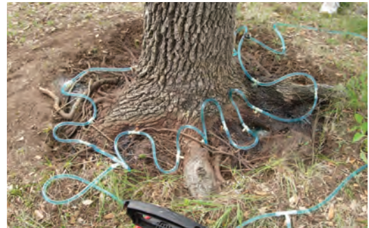
Alamo fungicide oak wilt infusion will last for 2 growing seasons. A second treatment will need to be done at the end of the second growing season.

White Oak Group (including live oaks): White oaks and live oaks may be treated preventively or therapeutically.